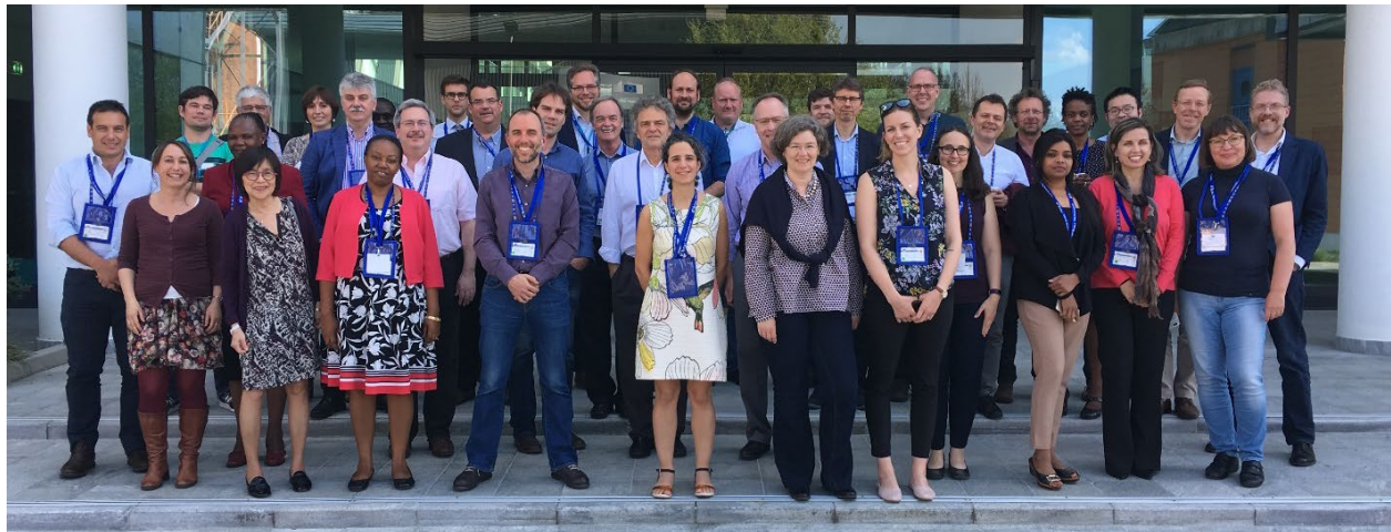
Participants in the GEOGLAM Workshop on Data and Systems Requirements for Operational Agricultural Monitoring 17-18 April 2018 in Ispra, Italy

Inputs into the requirements reboot came principally from the following actors at an April 2018 meeting hosted by EC JRC in Ispra, Italy.