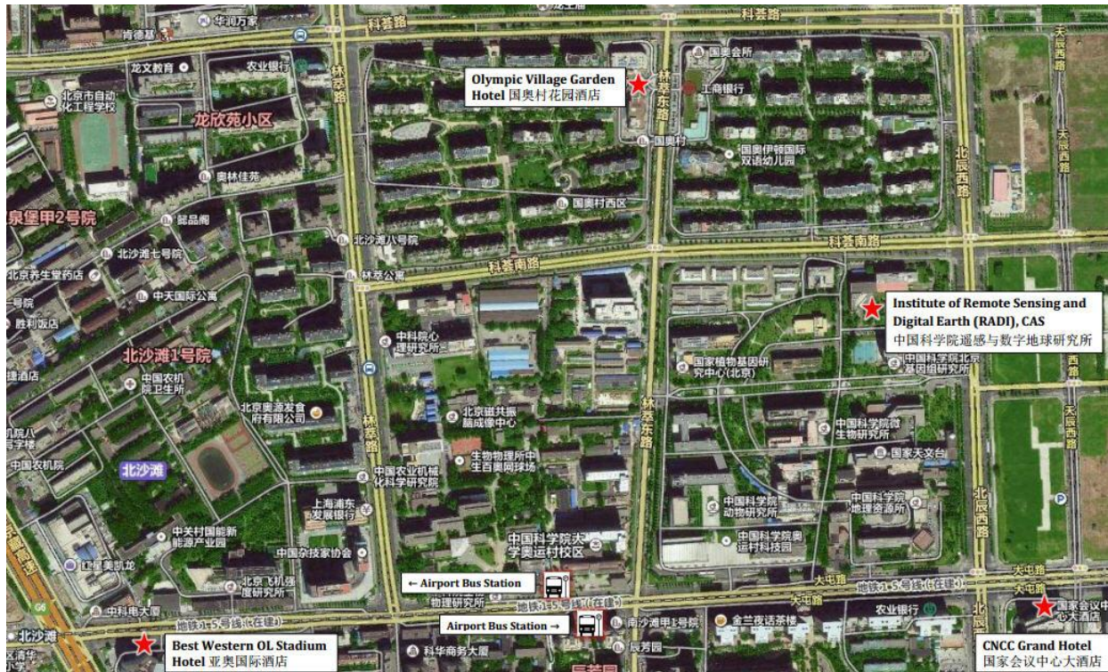
Map with location of the RADl Building, of the 3 recommended hotels, and of the bus stops of bus line n°6, from Beijing Capital airport.

Rate: 488RMB per night Address: No.1 Datun Road Beishatan, Chaoyang District Tel: +86-10-64874433 E-mail: dms@bwolympichotelbj.com