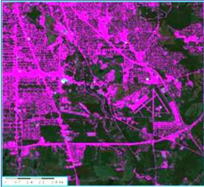
San Antonio, USA